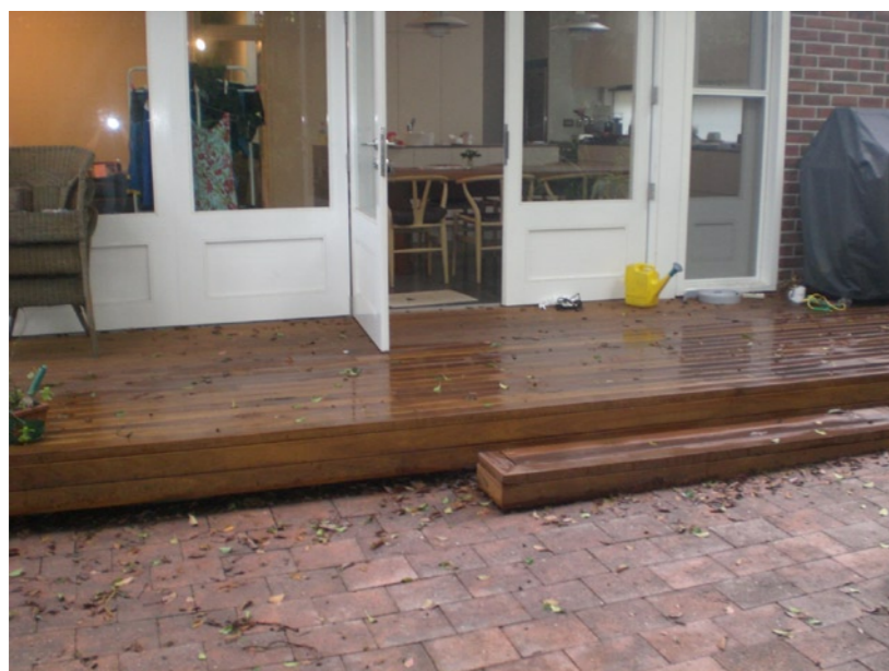
Completed deck with 523 gallons (1980 litres) of concealed rainwater storage