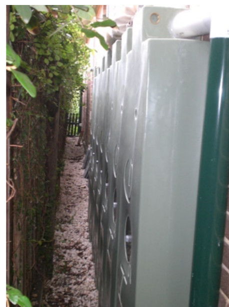
HOGs installed down the side passage between house and fence