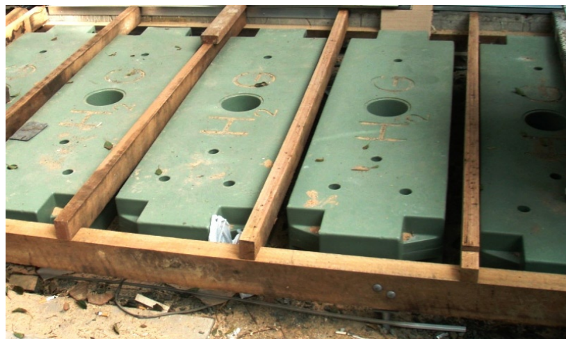
HOG modules are laid between the deck joists and connected beneath the deck